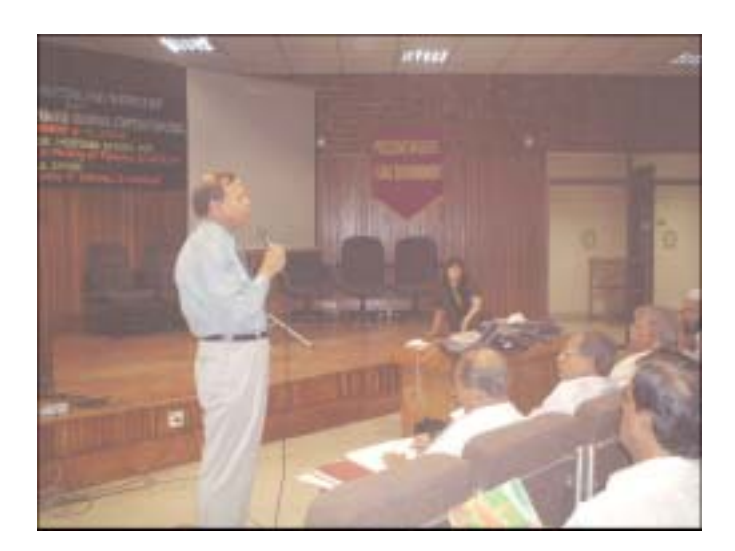
Director General, Department of Livestock Services relates his expectations

-- Surplus, hybrid & inbred animals are also quite problematic, therefore, contraception of zoo animals needs to highlighted especially for the felids (tigers & lions). -- I also expect to play an effective role in bringing about change in zoos in Pakistan by bringing together people to formulate a zoo legislation & association.