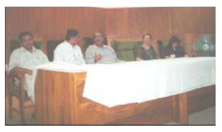
Dignitaries on the dias for closing function, Curator, Dhaka Zoo; President, SAZARC, Jt. Secretary, Dept. of Livestiock; Director General, Dept. of Livestock; Patron, SAZARC; Principle Trainer