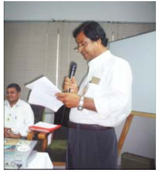
Curator, Rangpur Zoo reporting on his zoo

the primates of Bangladesh, their behaviour and ecology. From this he proposed changes to the way the gibbons were kept at the Dhaka zoo.