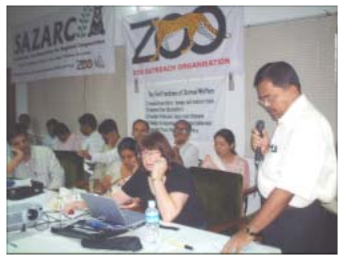
Curator, Dhaka Zoo

One area is responsible acquisition and deposition of animals. Zoos should not take animals from the wild, exchange between zoos, try not to use animal dealers, and make sure they know where their animals are going. Most of the rest of the day was taken up with SAZARC business. Committee reports were given and discussion centred around the topic of how to move the organisation forward.