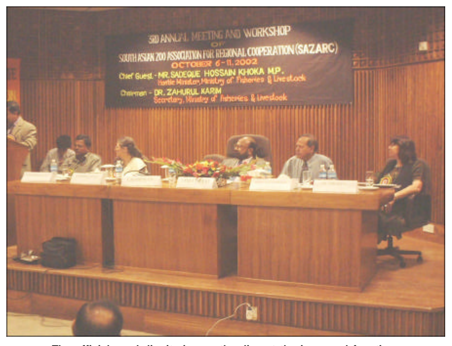
The officials and dignitaries on the dias at the inaugural function.

(SAZARC). I would like to offer my heartfelt gratitude & thanks to our honourable Minister and Chief Guest of the workshop for sparing some valuable time despite of