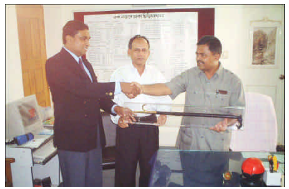
Director, National Zoo, Sri Lanka presents ornamental Ankus to Curator, Dhaka Zoo

A visit to the zoo was just the right touch to kick off the remainder of the conference, which consisted of zoo presentations from each and every zoo representative, technical presentations by invited resource persons, meetings of SAZARC with committee reports and discussions of SAZARC business and special working groups in subject areas of importance to the zoos of South Asia.