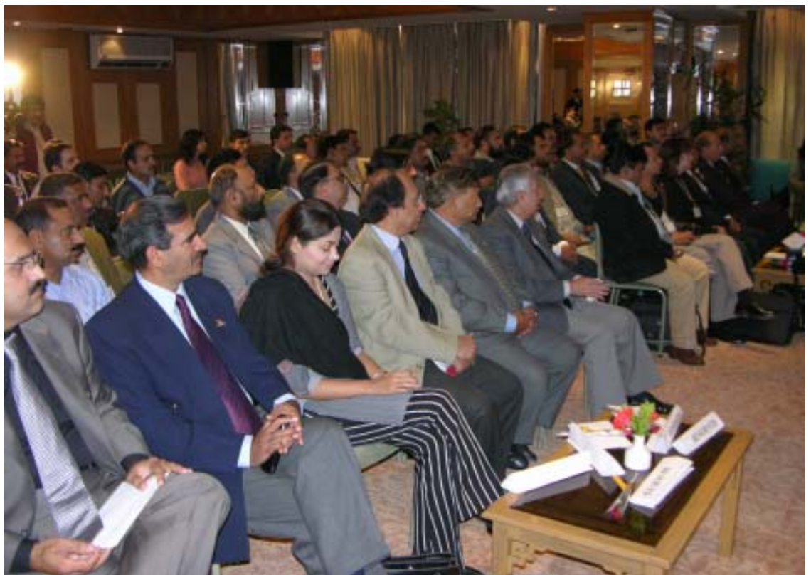
Audience at the Inaugural function of the 5th Annual Conference of the South Asian Zoo Association