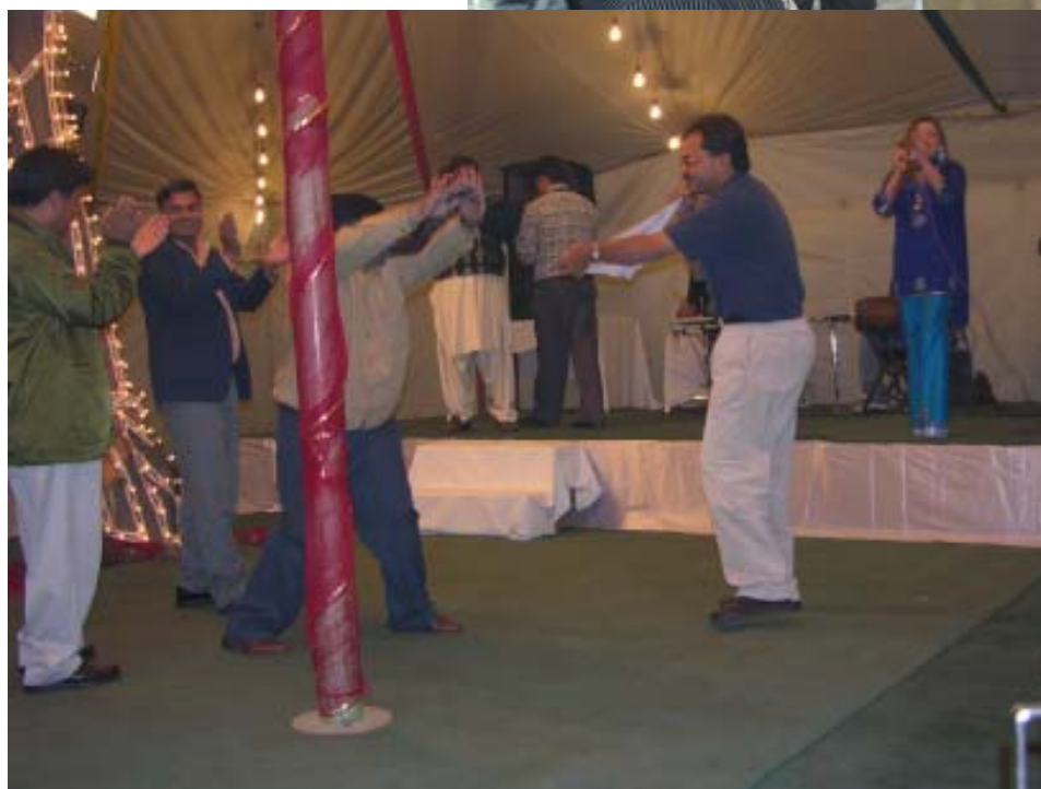
Zoo Directors dancing. No ladies allowed ! which irritated some of them to no end. Nonetheless, a good time was had by all listening to the popular Pakistani music and eating the excellent food provided.