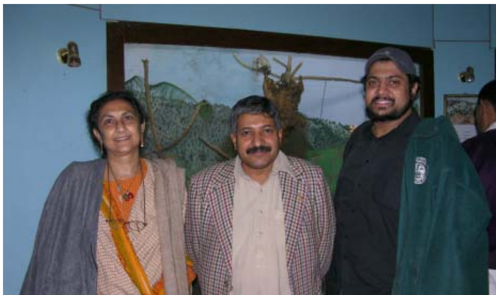
A tour of Jallo Park , just outside Lahore included a visit to the animal enclosures, the museum and a night of dancing (for the men , anyway!)