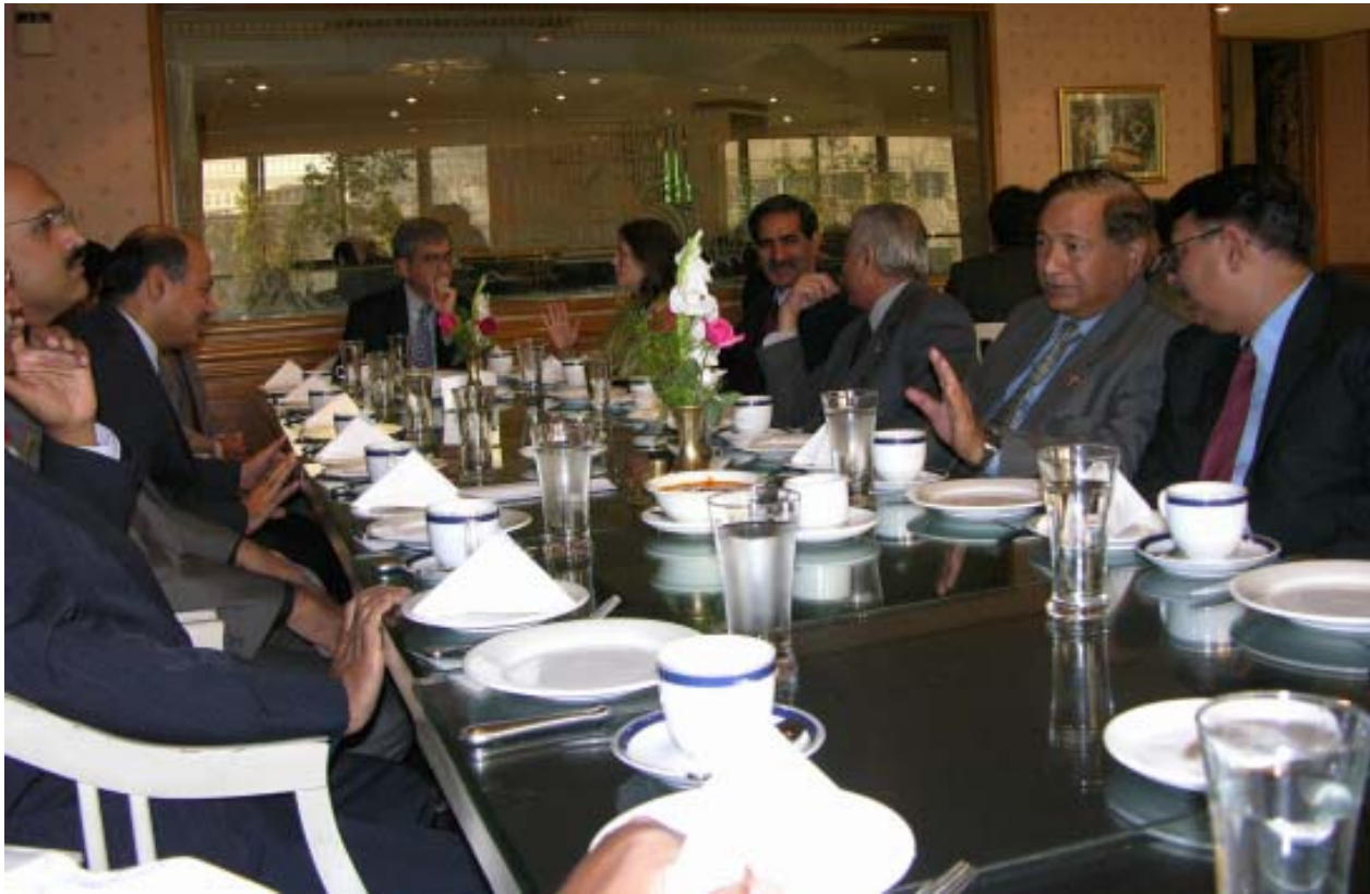
After Inaugural a special lunch at the venue was enjoyed by all.