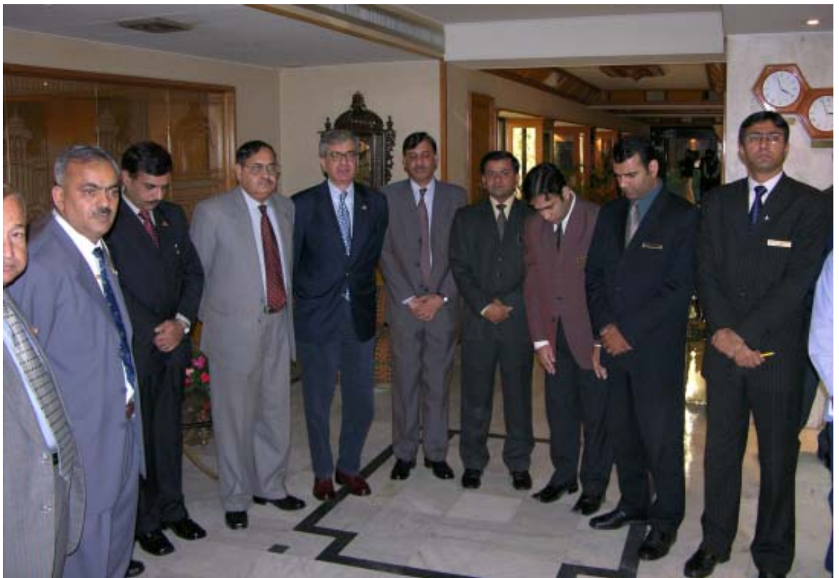
All officials and officers gather for a photo after the Inaugural. The Inaugural was well attended by both officials and non-officials.