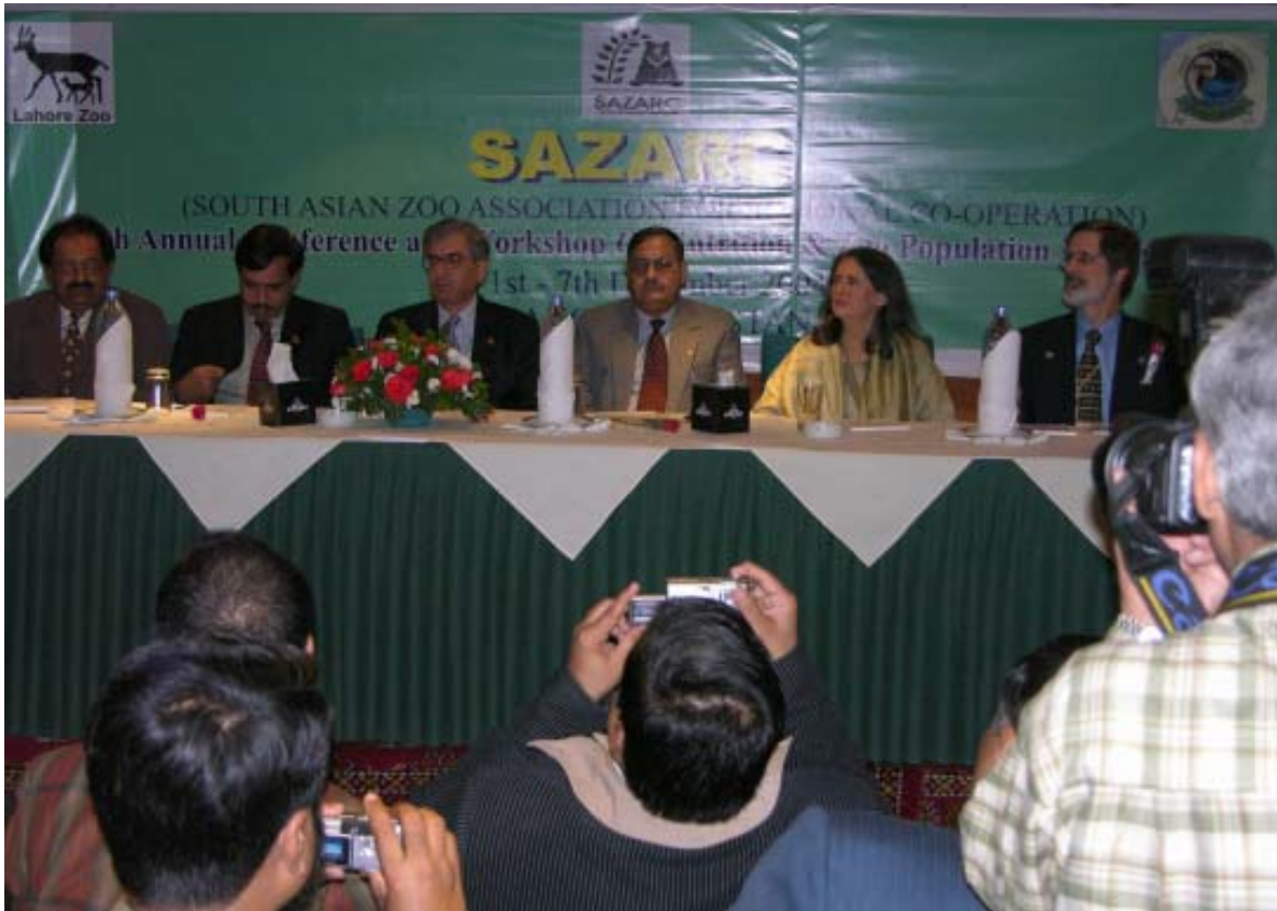
Dignitaries on the dias at the Inaugural function of the 5th Annual Conference of the South Asian Zoo Association for Regional Cooperation. Audience is below also with plenty of dignitaries.